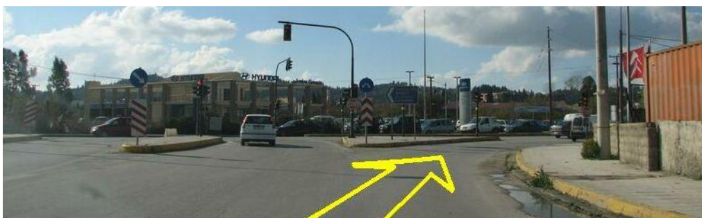
Take slip road RIGHT

Follow this road which becomes a dual carriageway for about 2 kms passing the Ports with the sea on your right all the way. When you reach a main junction with traffic lights ( see photo below ) keep to the RIGHT so you can you turn RIGHT (slip road) onto another dual carriageway ( sign to PALEOKSTRITSA ).